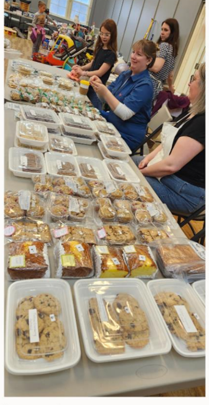
Rummage and Bake Sale - May 4, 2024 Thank you to all for your support!