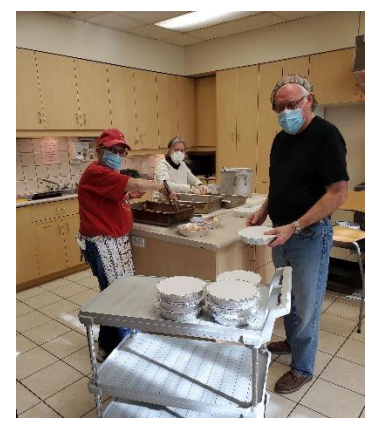
Submitted by Johanna de Bruin

The above is merely a thumbnail sketch of what transpires on a typical HOOTC day.