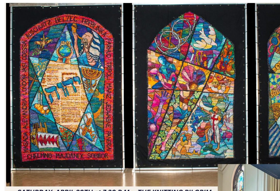
SATURDAY, APRIL 20TH at 7:30 P.M. ~ THE KNITTING PILGRIM