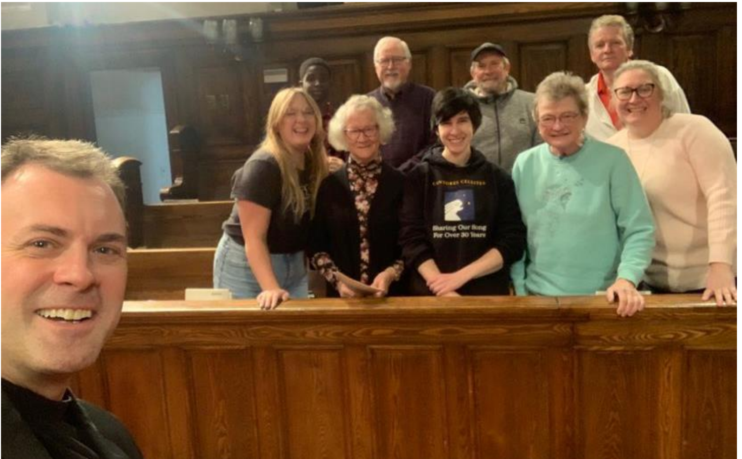
CPC Choir, not all members present