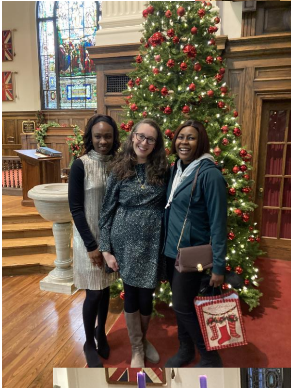
Glimpses from the Christmas Eve Pageant, December 24 th , 2022 4 p.m. service.