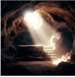
The empty tomb on Easter morning