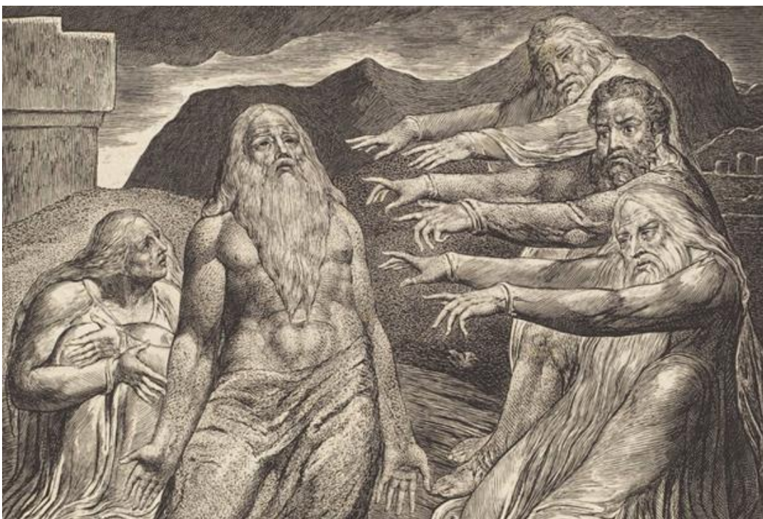
William Blake, Job rebuked by his friends