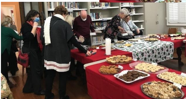
Cookie Walk December 2023