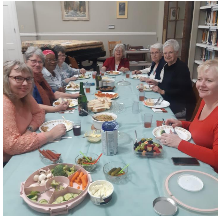
Knit and Knatter Christmas Luncheon