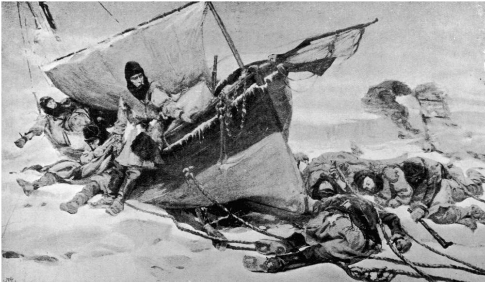
Friday November 16 th 1821 Travelling

Quoted from the journals kept by Dr. John Richardson (1787-1865) in A Discovery of Strangers by Rudy Wiebe.