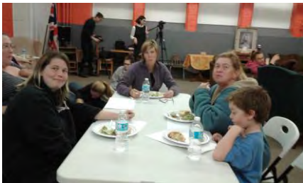
Moms and children enjoying dinner!