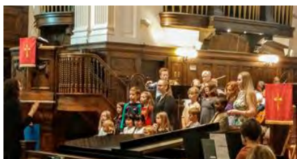
Children singing during a Sunday service