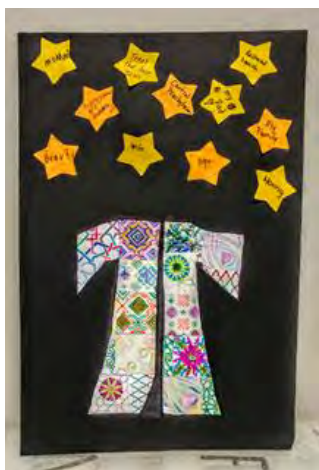
Joseph's amazing coat