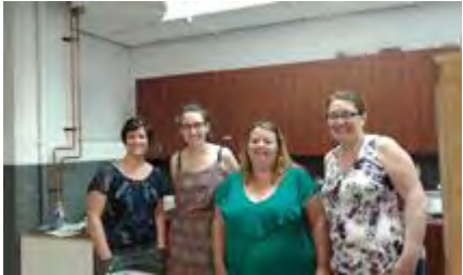
....and servers at the moms to moms dinner.