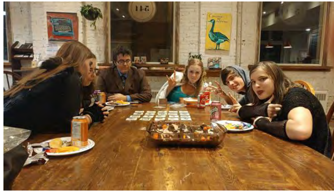
Games night with other youth at 541 Eatery and Exchange

To worship God, grow as Jesus' disciples, care for one another, and take God's love to the world.