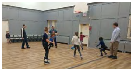
Our youth getting active