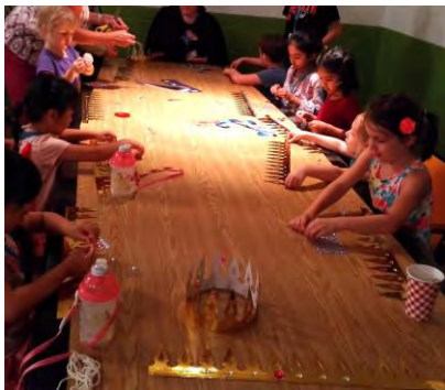
Craft station at Summer Adventure Camp