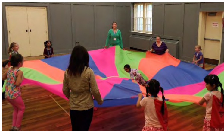
Kids enjoying Parachute Games at Summer Adventure Camp

Please visit us on Facebook https://www.facebook.com/cpchamilton.ca/