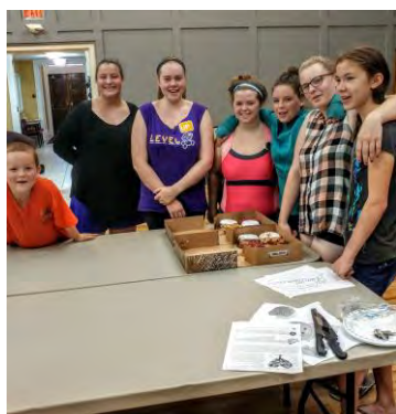
Teen volunteers at Summer Adventure Camp enjoying some well-earned donuts