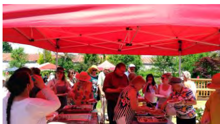
Enjoying lunch at the picnic!