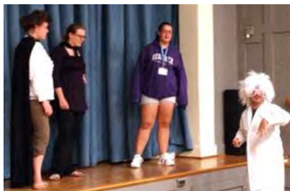
Super Hero Academy Skit