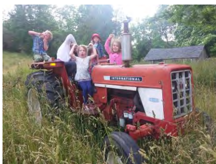
Future choristers having a great time at the choir end of year get together!