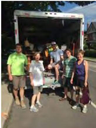
Refugee team moves furnishings on move in day July 15, 2017